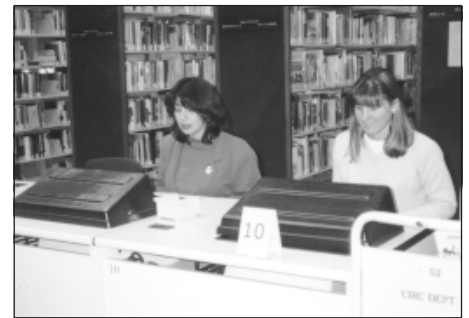
The Friends of the Library, which raised nearly $61,000 at its four used book sales in 2001, purchased 12 new computer desks like this one for the downtown library.

The downtown library's Reference Department is now equipped with 12 Nova computer desks, thanks to the Friends of the Library. With these desks, computer monitors are recessed, so library customers look down to view the computer screen through a flat glass desk top. The desks also have pullout keyboards.