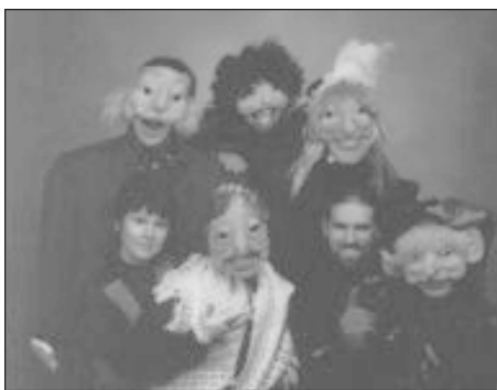
The Adzooks puppeteers will present the famed tale, The Tortoise and the Hare, at three shows on Thursday, June 6.