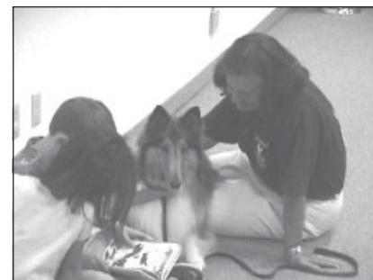
Reader dogs love to hear children read stories.

Learn more at an orientation and information session, Friday, June 4, 2 p.m. , downtown.